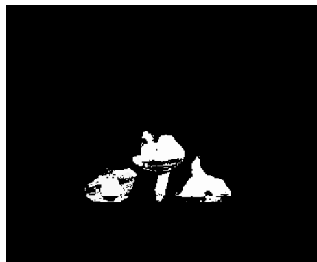
(a) Original image.

According to the statistics, the gray peak values in crowd distance image concentrate in a certain range. We can process the image with threshold method. This method compares peak value with detection value to determine whether the target belongs to the person or not and avoid the disturbance from other targets. It can segment crowd image to individual image. Fig.4 (b) is the final segmentation result of Fig.4 (a).