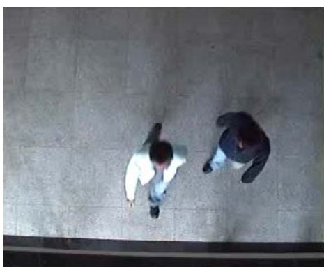
(b) De-noise result.