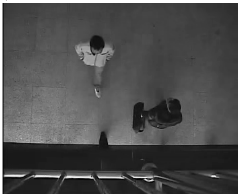
(a) Original image.

background of video changes little with the camera fixed and this algorithm is in smaller operational volume. The system could ensure the accuracy of the extraction of human activities by using this algorithm. Fig.2 (b) is the final extraction result of Fig.2 (a).