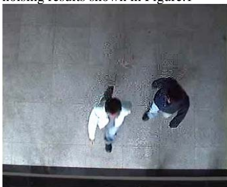
(a) Original video.